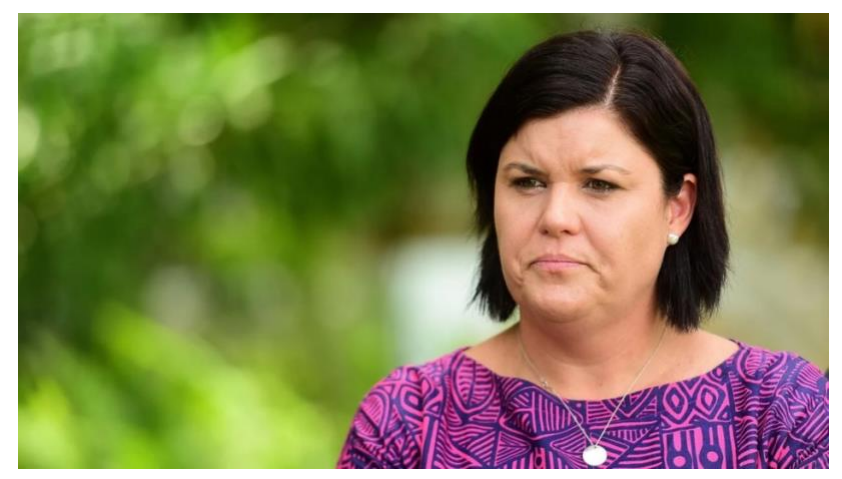
Natasha Fyles MP

Land Down Under, Northern Territory Chief Minister Natasha Fyles, Thumbs up Fracking Beetaloo Basin, Deliberately combusting One point four billion Carboniferous subsidised tonnes: Broil oceans Pollute atmosphere Murder Great Artesian Basin (Mother's largest Underground water).