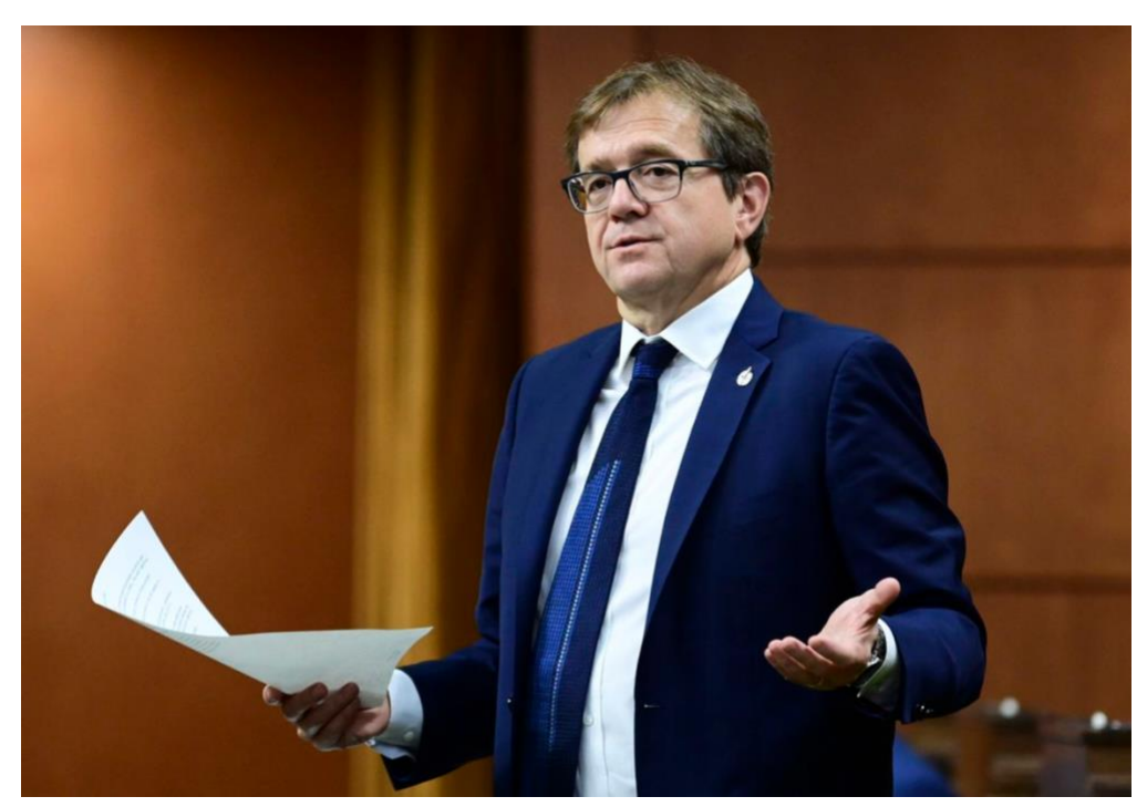
Jonathan Wilkinson MP

Minister Natural Resources Jonathan Wilkinson, Twenty-four occasions Wining dining extravagances Department, Minister, high life, Budgetary fuel subsidies fatten'd! Unmeaning net-zero Effectively promoted, Tar sands, fracking, pipelines Forever Baby!